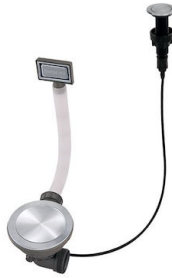
VIDAGE FADE PUSH INOX A407 A16