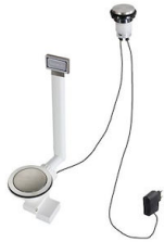
VIDAGE FADE LIGHT A407 A17